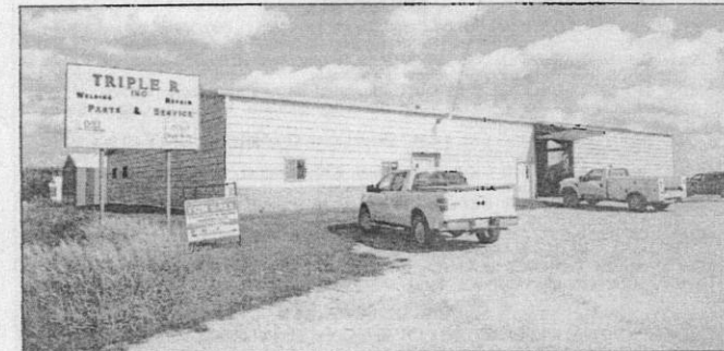
Triple R Inc. is the first business to be inducted into the O'Brien County Value-Added Agriculture Steering Committee's 15-year-old Agriculture Hall of Fame.